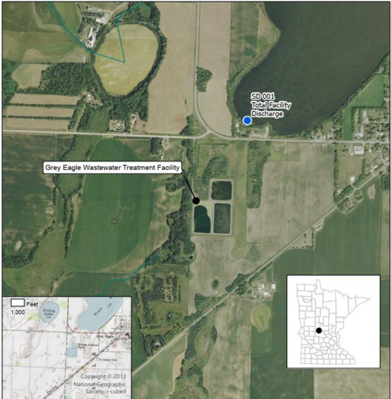
Map produced by: MPCA Staff, 9/9/2025 Scale: 1:12,000